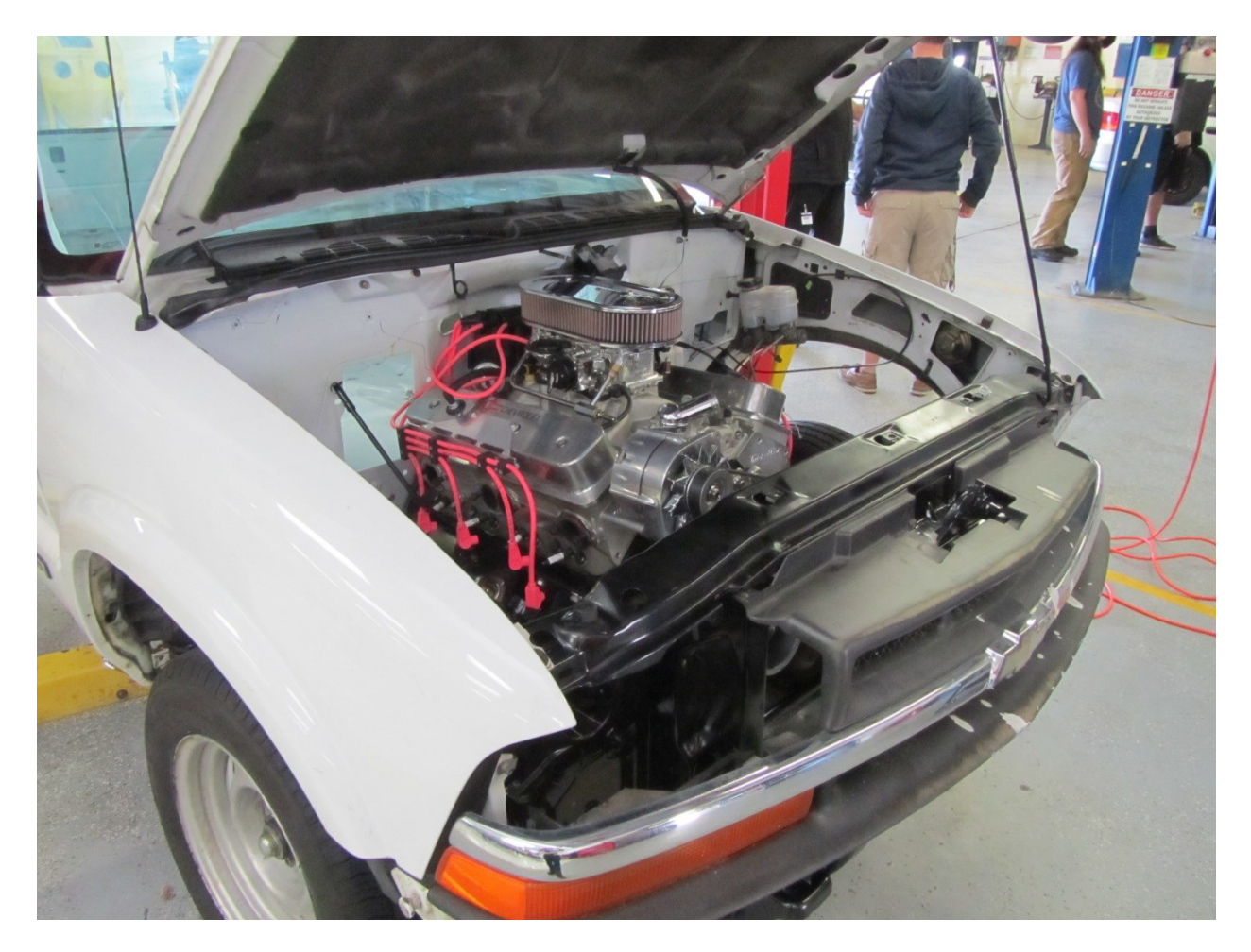
Race truck powered by a modified Chevrolet 350 engine and using a four-link rear suspension to improve traction and handling

The Tallahassee Region AACA (TRAACA) recognized the importance of the Lively's automotive service technician program and wanted to do something to support the students and help promote automotive technology as a career path. The scholarship program began four years ago and is very popular with the students. The school welcomes the support of the antique car club and graciously provides space for monthly dinner meetings. Wonderful meals are provided by the Lively Culinary program to build catering skills and support another of the college's popular programs.