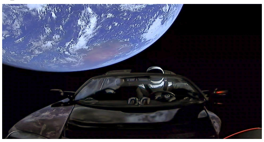
A Tesla Roadster launched with the SpaceEx company run by Elon Musk. Why? Because he could!