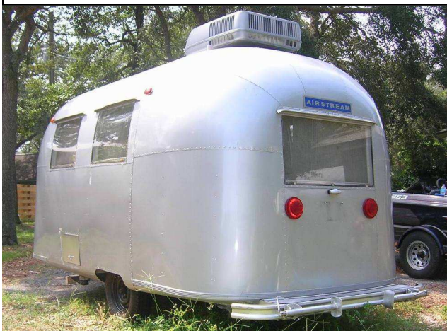
1976 Airstream, 17' Caravel

Remember the man that said, "Go West, Old man"? Maybe this is not just right, but this is what Junkyard Dog and Fluffy did. As you know, old becomes new whenever you start collecting and fixing up old vehicles. There is a trend now to restore older trailers, the smaller ones. Smaller ones because they can't afford large ones or do not plan to use it for longer trips and long periods of time. Jack recently appraised a small and older Airstream. It was in fairly good shape, but like our old cars, it needed lots of TLC, and remember that means Takes Lots of Cash. With trailers in mind, Fluffy remembered seeing an older trailer on the other side of the lake. So with the owners permission, Junkyard Dog and Fluffy went for a picture taking session. Doesn't Big Red look like he's ready for an adventure on the road? Keep on sniffing, you never know what you'll find. Junkyard Dog and Fluffy