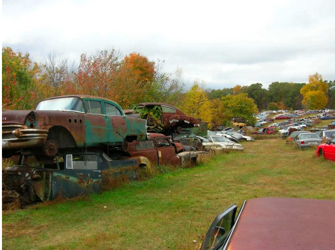
Fall Colors in Klinger's Junkyard Great—Day 9