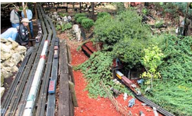
Nell getting close to check out the detail.