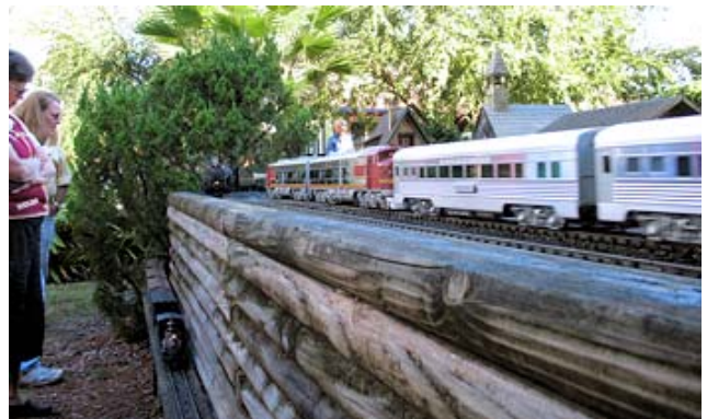
Three trains going at once!