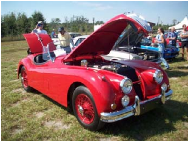
The McCollum's 1956 Jaguar XK-140MC