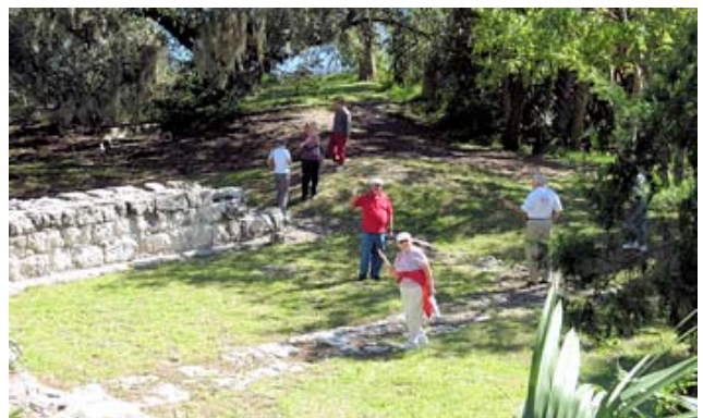
The folks checking out the ruins of the old fort at San Marcos.