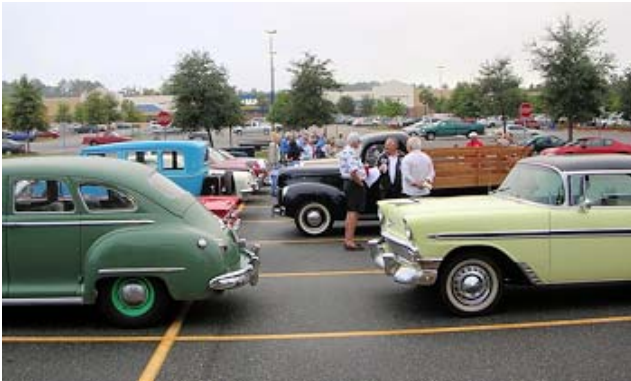
Gathering at Wal-Mart to start the tour.