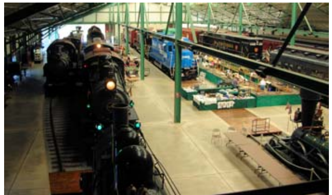
What a model train layout!