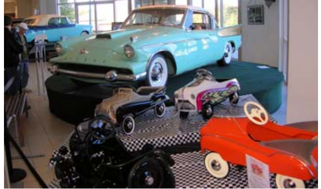
Inside the entrance to the AACA Museum.