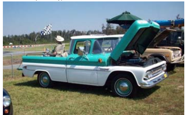
Reuben Plachy sitting in the back of his 1960 Chevrolet Apache 10 pickup watching the racing action.