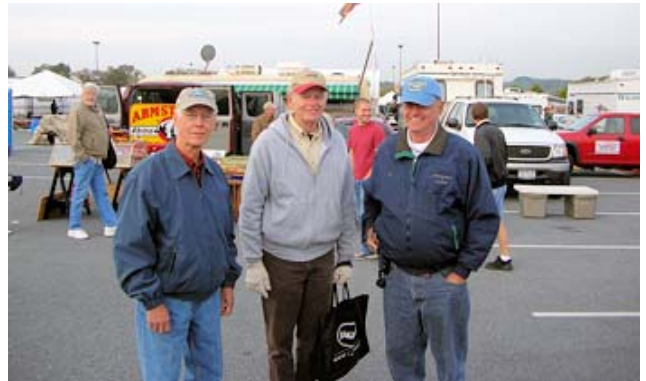
You're always meeting friends at Hershey!