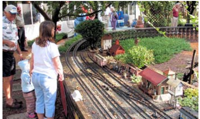
Fascination with trains knows no age limit or gender.