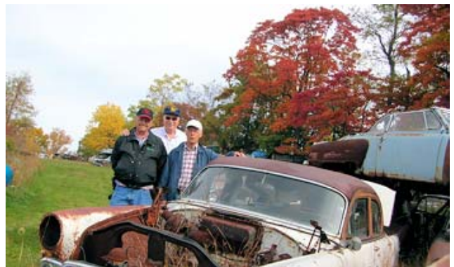
The boys doing what they love to do best, playing in the yards!