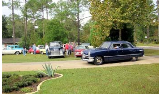
Filling up the yard of Eric Ecklund in Crawfordville.