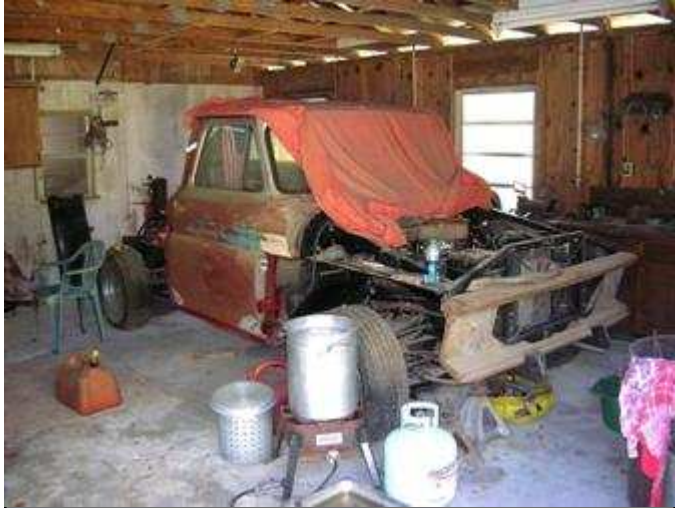
1965 Chevrolet Pickup