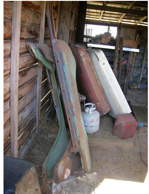
'65 Chevy PU Fenders & Hood