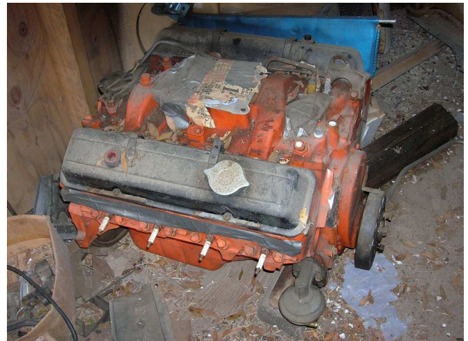
1984 350 engine - was running

International Vehicle Appraisers Network