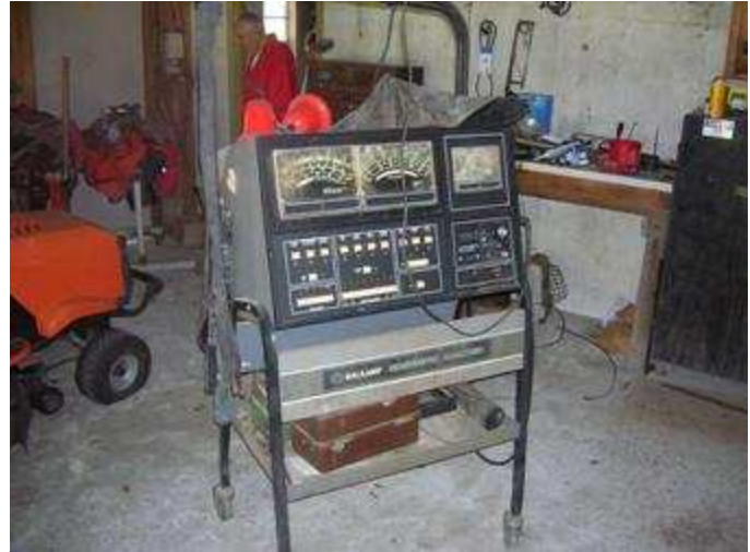
Western Auto test unit