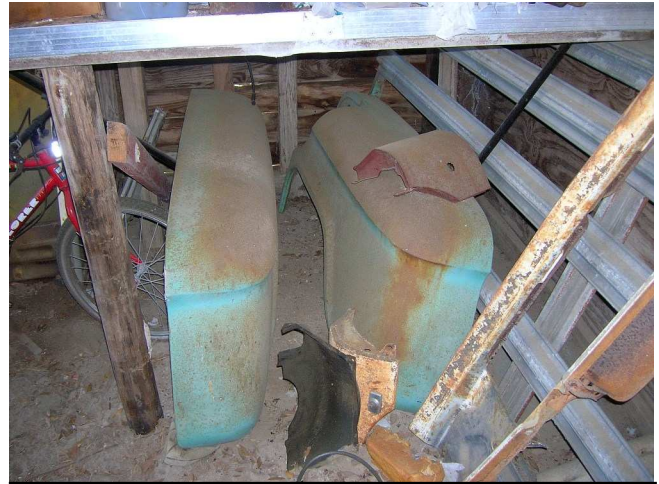
1965 Chevrolet Pickup Fenders