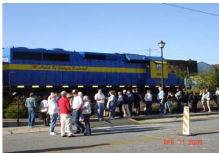
Riders gather at depot in Cordele for Plains, Ga.

This article was originally prepared for The Lantern published by Big Bend Model Railroad Assoc.