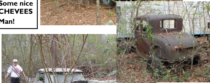
A Model A fixer-upper