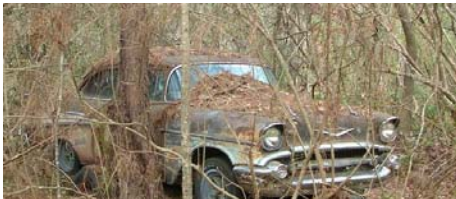
Some nice CHEVEES Man!