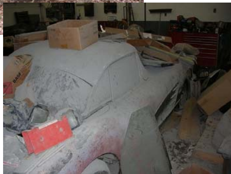
Looks like a 1959 or 1960 Vette that just needs washing right?