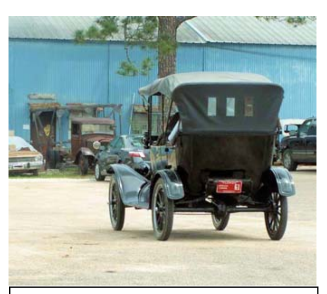
It still "motor-vates" after all these years.