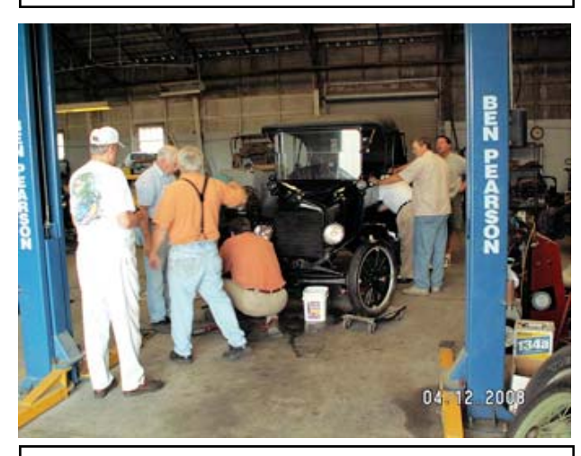
The boys get a lesson in Model T restoration.