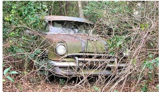
The Gainey Farm in Georgia — Grandpa's 55 Pontiac