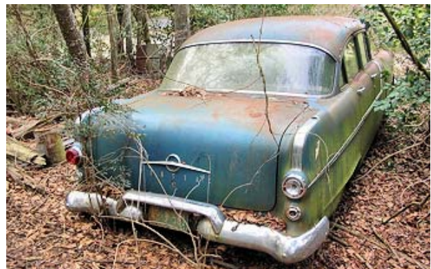
The Gainey Farm in Georgia — Grandpa's 55 Pontiac

International Vehicle Appraisers Network