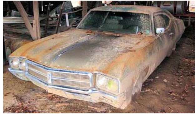
The Gainey Farm in Georgia — 1969 Buick Skylark