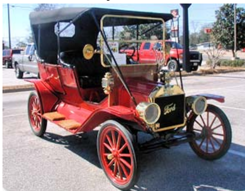
See more of these fine Brass Era cars on pages 6 & 8