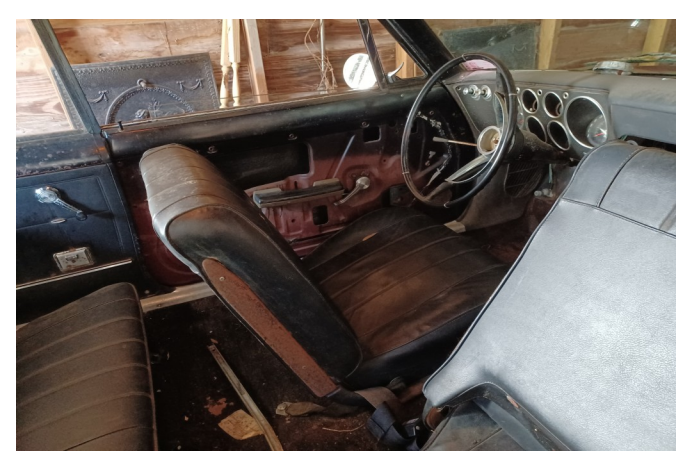
The interior has a Corsa dashboard with full gauges. It is a four speed transmission that is free and shifting. The seats need a good cleaning and armor all. I have the door panels and all handles.

I have purchased a lot of parts needed to get it going and now have a lot of hand work to do. The engine is free and turned over.