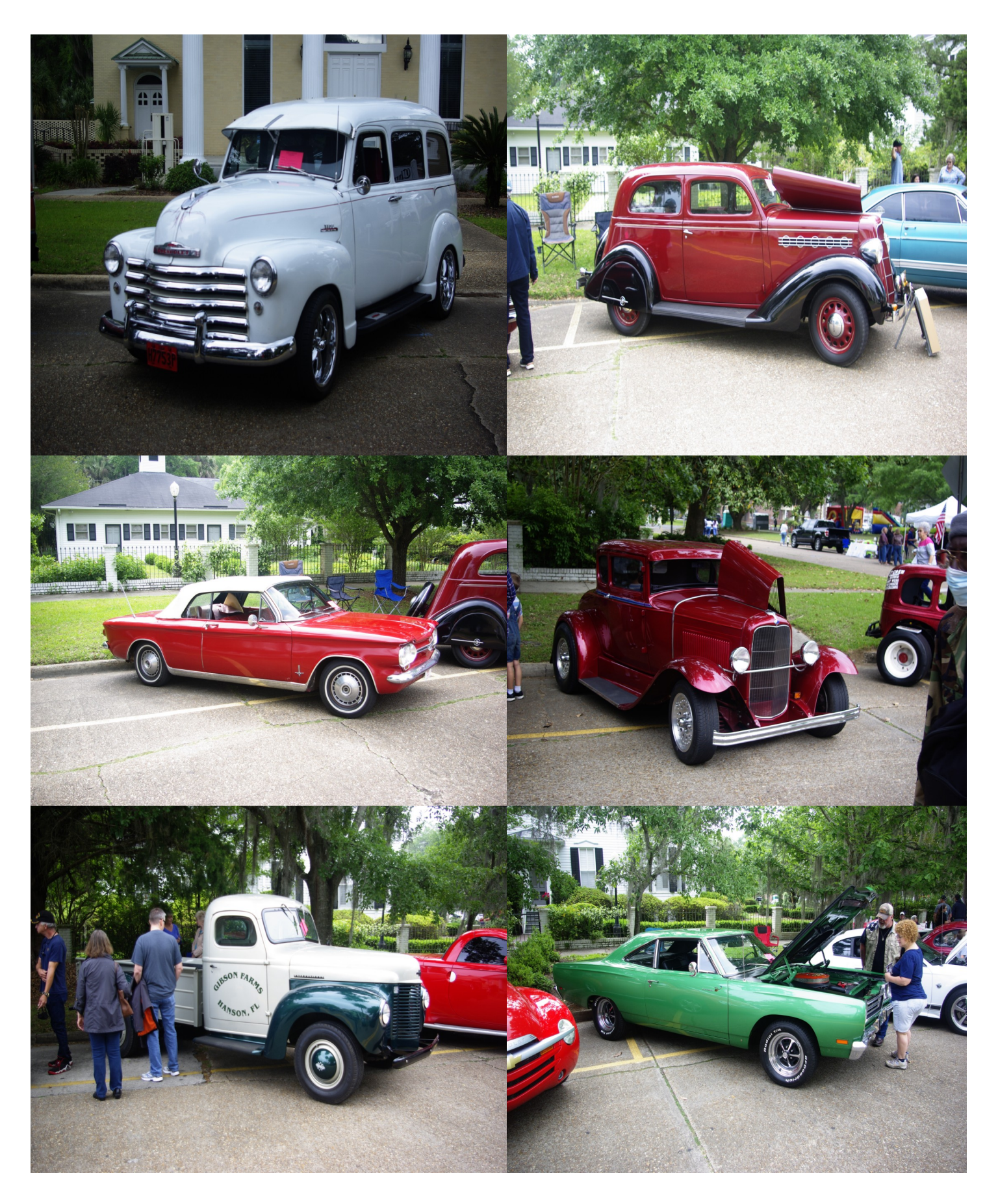
2021 Madison Down Home Day Cars