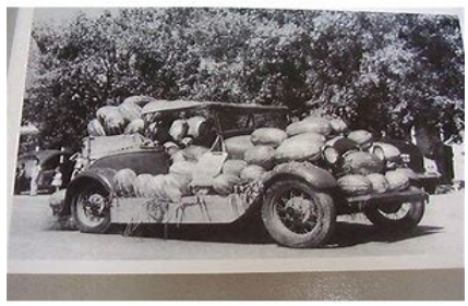
Craig gathering watermelons for the show