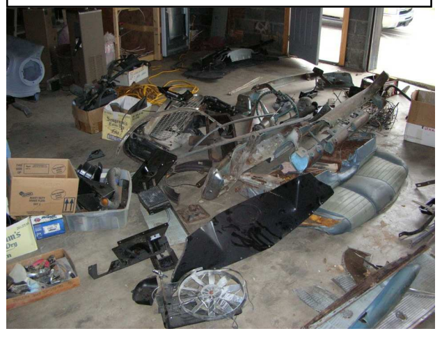
T-Bird with No Dash, Doors, Hood, etc.