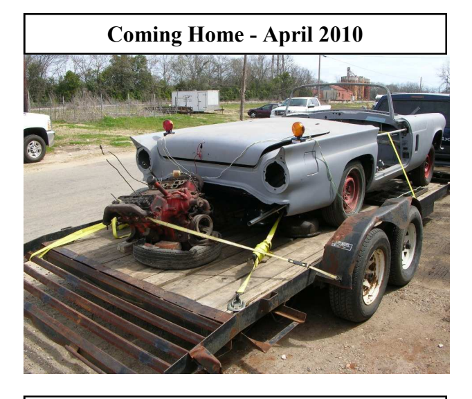
Take T-Bird Apart