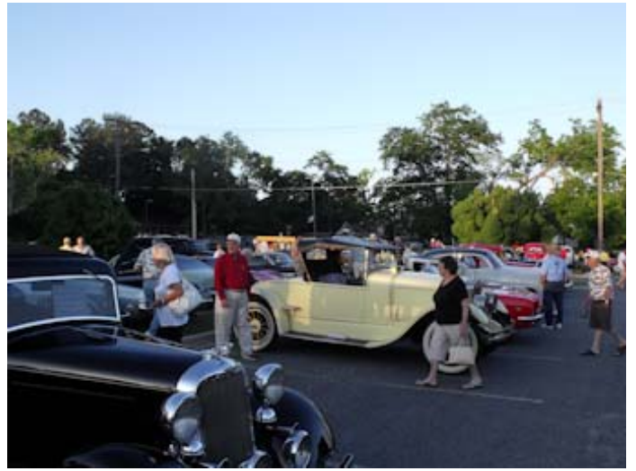
Getting ready to join the gas-light parade.