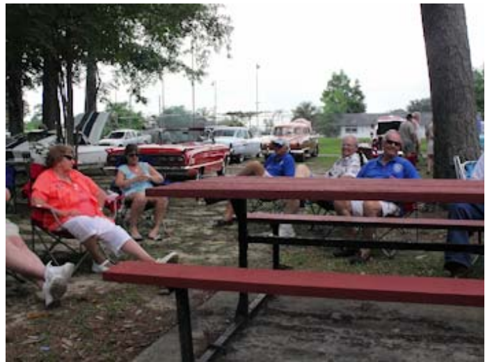
Relaxing at the Show in the Park.