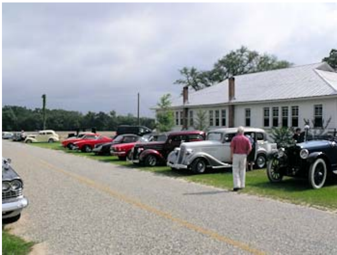
Mid-way stop at the old school house.