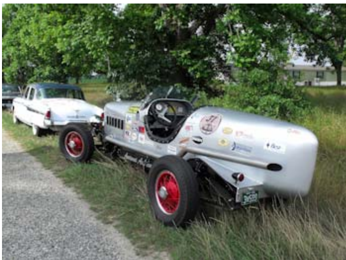
How often have you seen a real race car on a cruise?