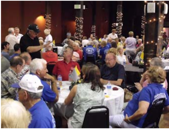
Club members socialize while waiting for the barbeque to arrive.