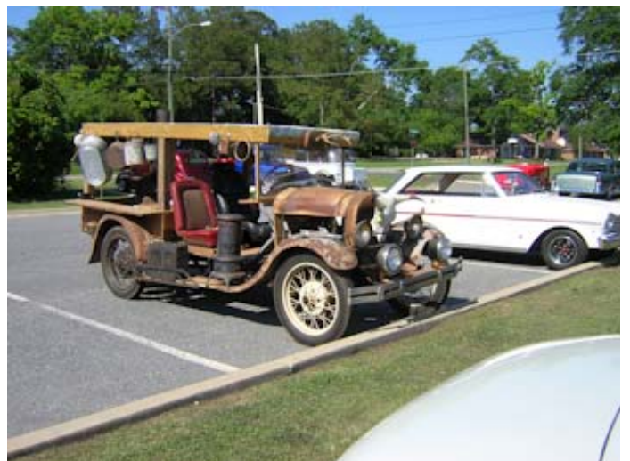
A real down-to-earth classic! Believe me, they had a blast!