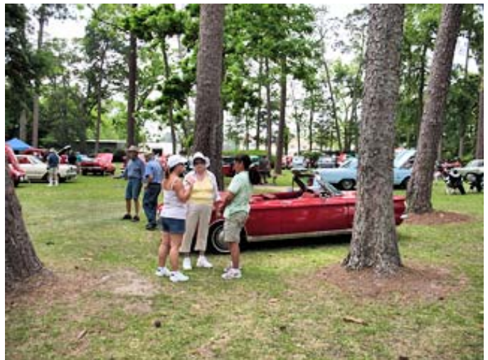
Beautiful cars, pretty ladies and great weather. What more could you ask for?

More complete coverage coming soon to the TRACA website.