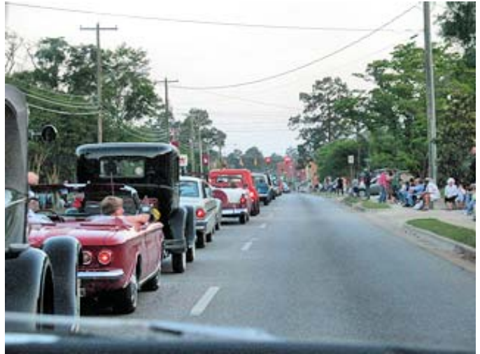
One of the largest car parades in the area, the Gaslight Parade.