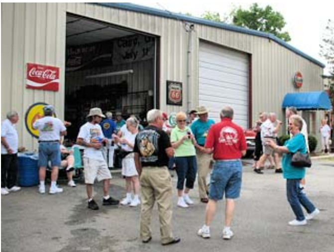
Enjoying sodas and snacks with friends at the Cairo Antique Auto Museum.