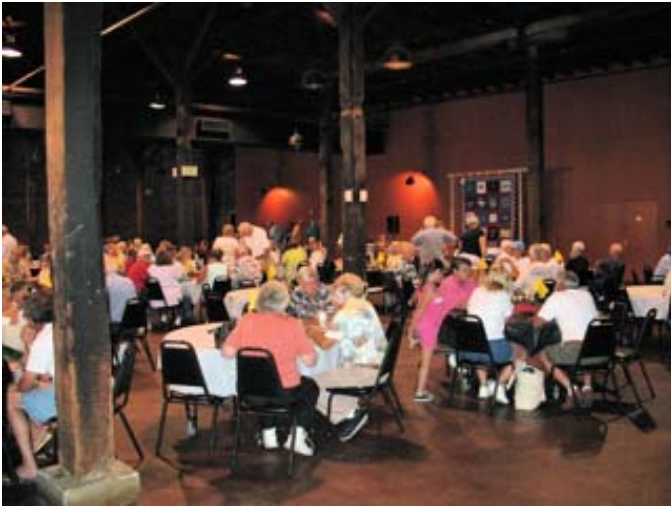
Great food, with good friends kick off a great weekend.