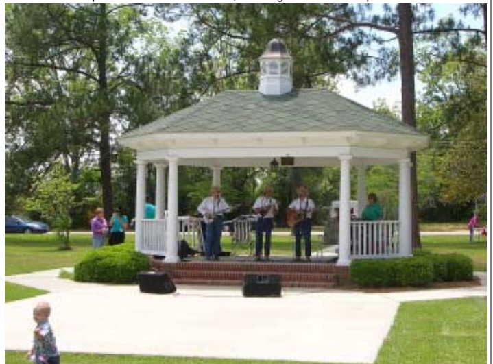
A local group kept everyone entertained from the gazebo