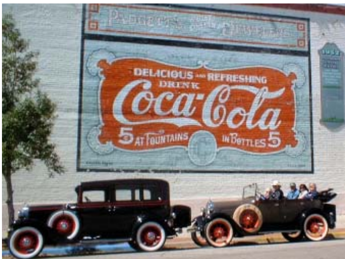
One of the most notable and distinctive views was the above restored signage on the side of one of the main downtown businesses.