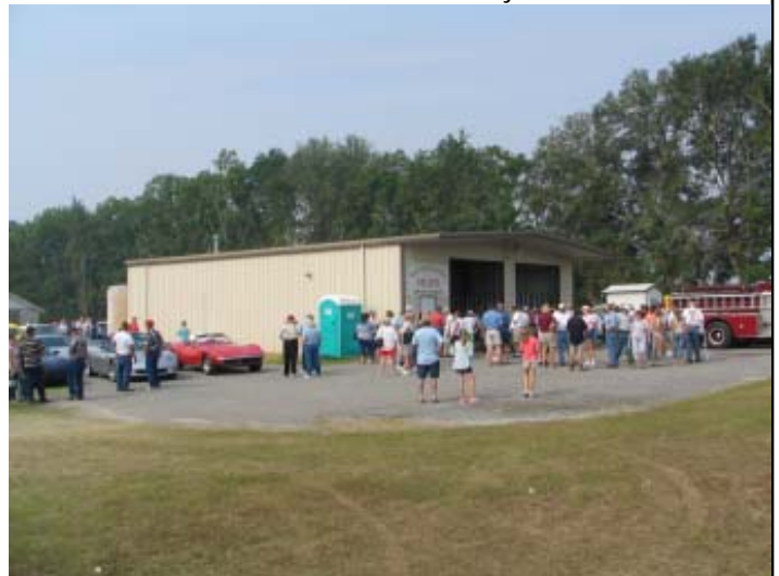
Midway point in the rally. Enjoying RC Cola and a Moon Pie with the firemen.