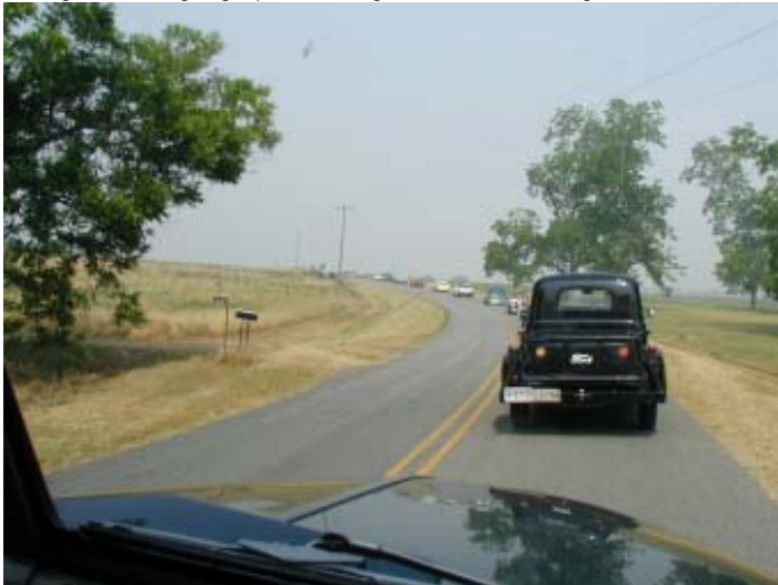
Despite some smoke from forest fires many miles away, it was still a nice drive.