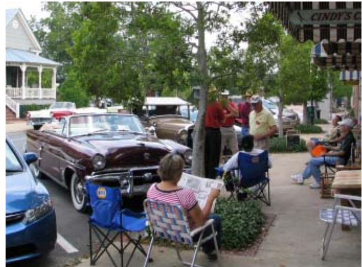
It was very laid back and just a day to sit in the shade and converse with friends and passers-by and show off our rides. Later at a party given by a one of Havana's car enthusiasts and show promoters, a well known celebrity stopped by to entertain us.....