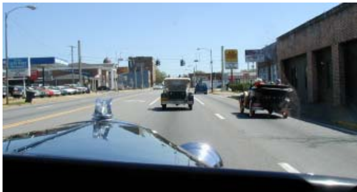
A total of 9 Model A's (10 if you count the hot-rodder that stopped by) showed up along with Pete Zulinke's beautiful 31 Chevrolet. Some of the A's were used to carry members around to view some of these old residences.