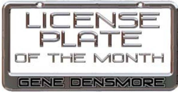
1932 NEW MEXICO LICENSE PLATE