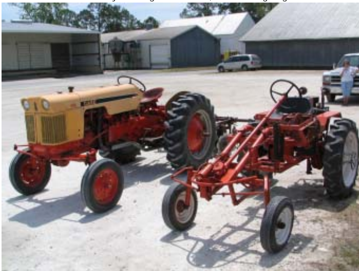
Not everyone brought old cars (this is a rural area!).