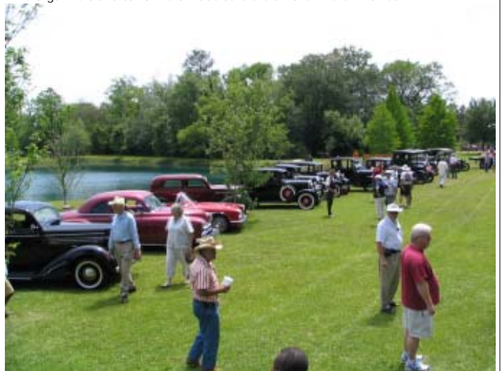
After a short parade around downtown, we all gathered at the park.