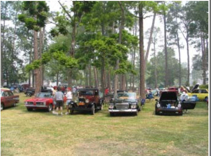
Displaying the cars and meeting friends in the shade of the big trees in the park.