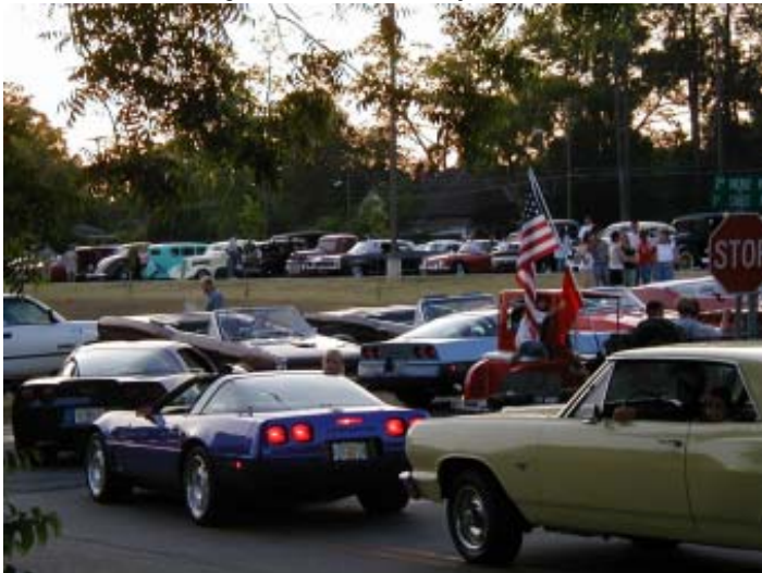
Rolling out for the gaslight parade through downtown Cairo (largest turnout ever!).