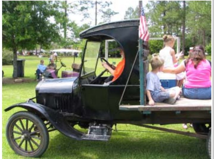
The organizers and car owners made sure the children were involved.