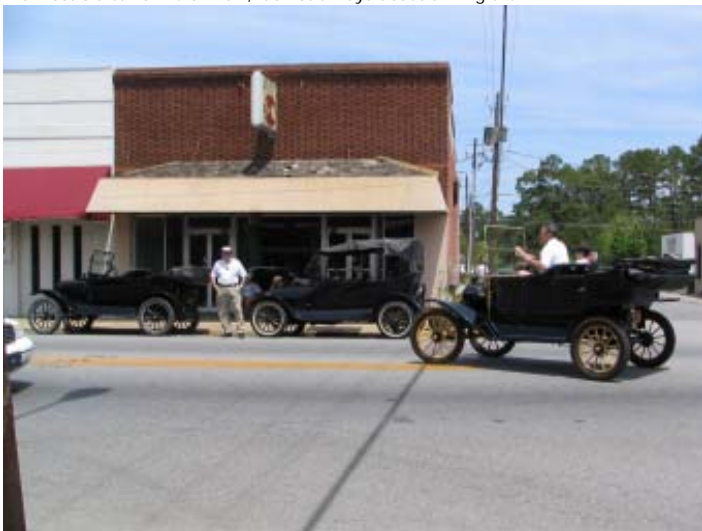
The A's and T's were always moving around town, some even giving rides!