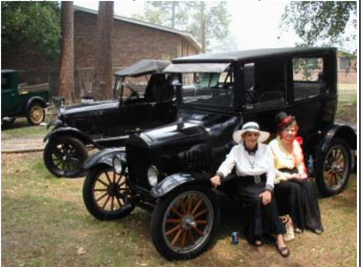
Enjoying a day with the old cars, isn't that what it's all about?