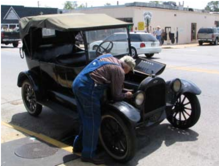
As most old car owners know, it's not always about driving them.