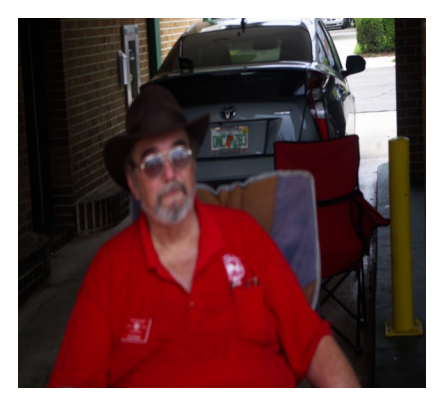
Looking forward to Watermelon Festival 2023!