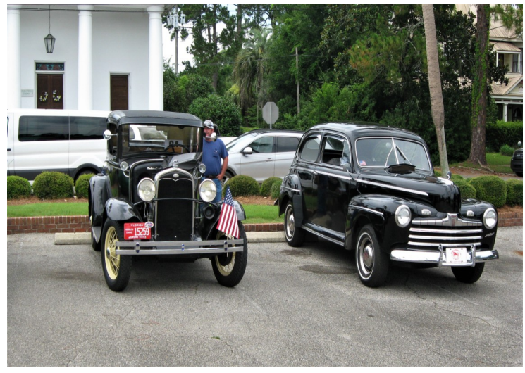
Honeybun 1931 Ford and Wally 1946 Ford