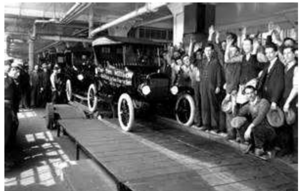
Ford-T 10 Million (4 juillet 1924)