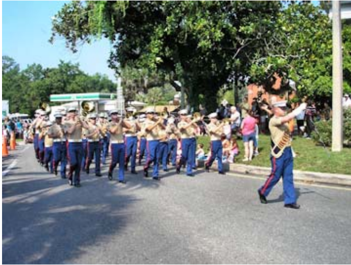
USMC Marching Band entertains in the parade.