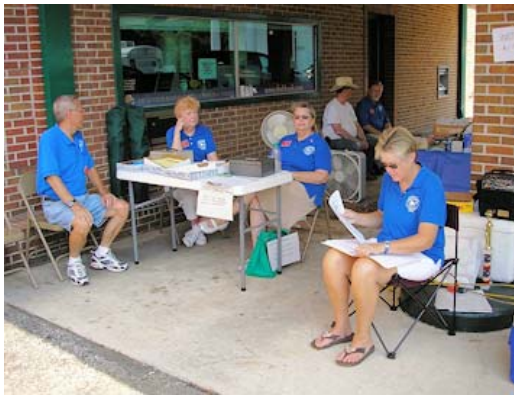
Show organizers and helpers keep things running smoothly.