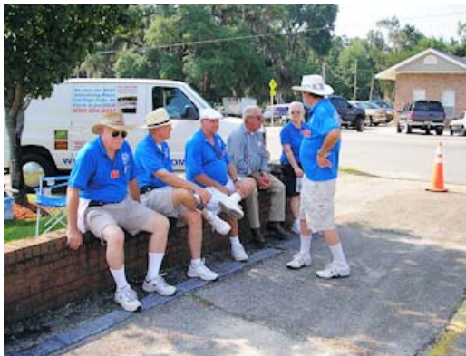
Parking attendants(?) and traffic managers!