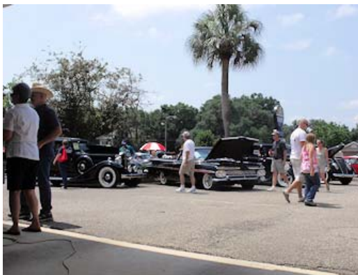
Show goers love to look at the old cars.