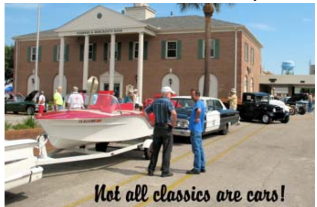
Not all classics are cars!