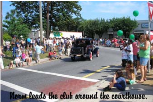
Norm leads the club around the courthouse.