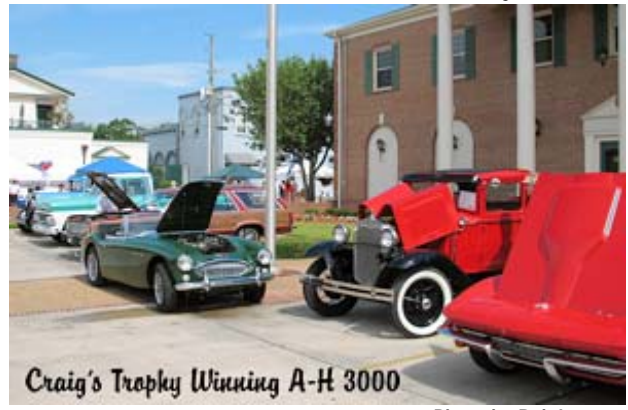
Craig's Trophy Winning A-H 3000