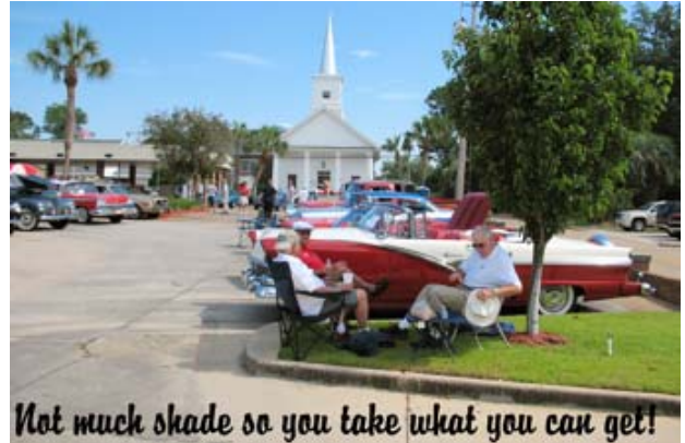
Not much shade so you take what you can get!