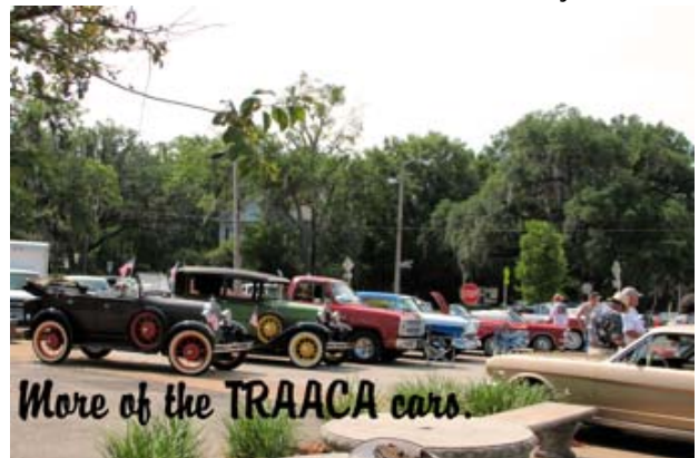
More of the TRAACA cars.