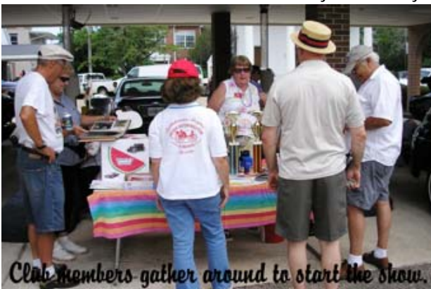
Club members gather around to start the show.