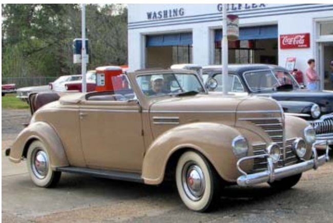
Bob's first convertible.....

I sold The Mouse for $50 when I went off to college in the fall of '56. When we started looking for another '39 Plymouth business coupe five years ago, (like others, looking for cars of their youth!), we discovered the '39 convertibles instead, (see below) and we're now on our second one, which has been completely rebuilt mechanically by Neal over the past couple of years. It's such fun to drive with the top down, and with the top up it's just as cozy as the business coupe!