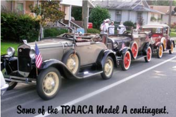
Some of the TRAACA Model A contingent.