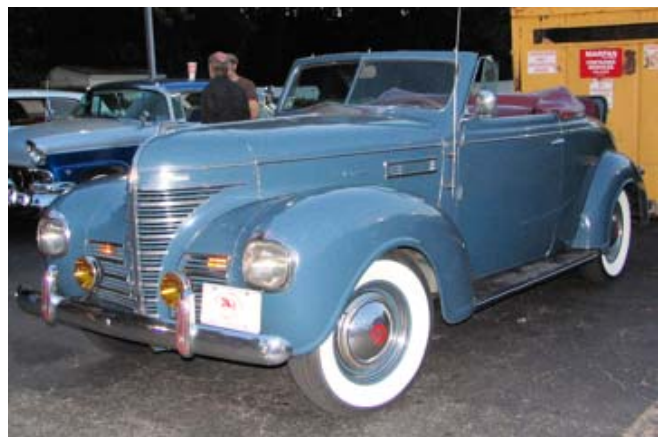
And his latest!