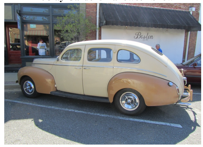
Boston Ga tour