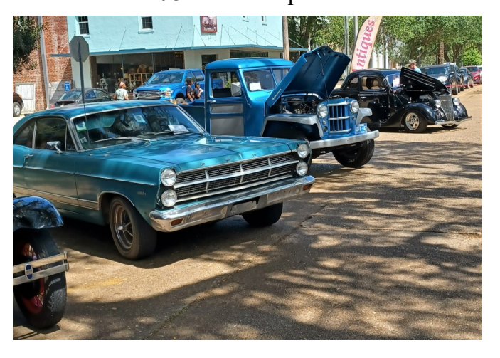
Madison Down Home Days April