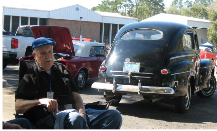
Lively Car Show in March 2022