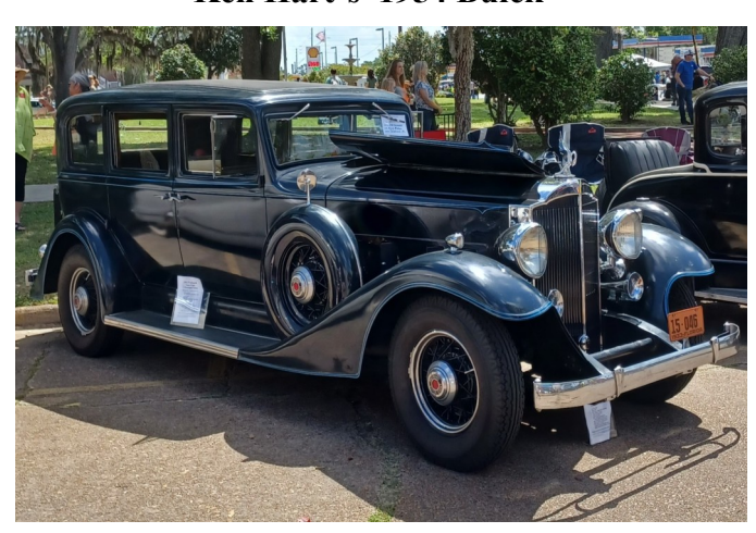
Honor Flight Show in November.