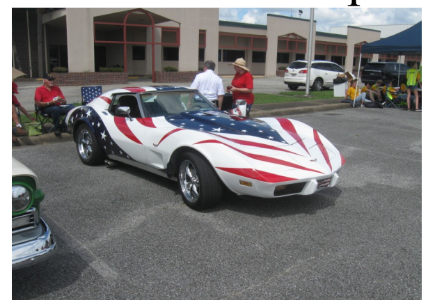
Lions Club Show