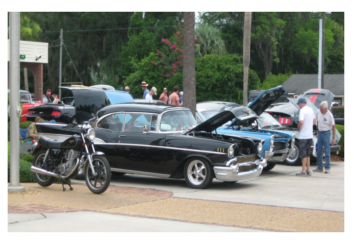
Watermelon Festival June 2022