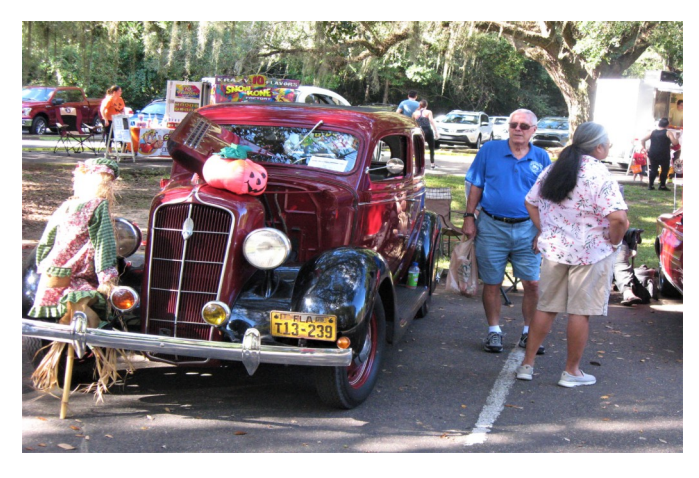
McClay Gardens Halloween Show