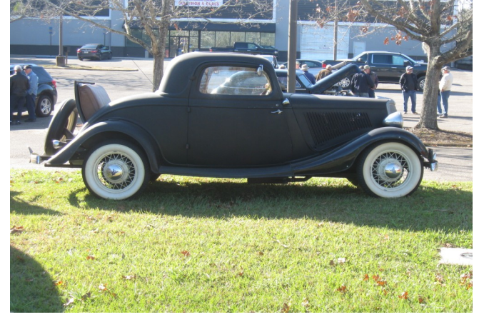
Neal Davis' 1934 Ford Coupe at C+C