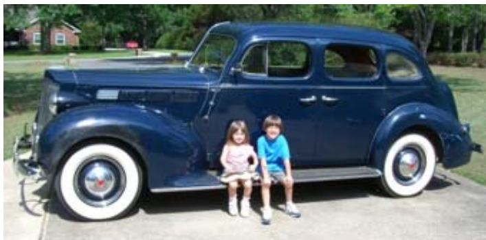
The Big P and some little friends.