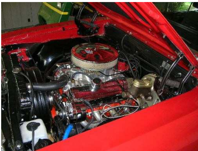
1967 Chevy Chevelle SS - Fresh 396 Engine