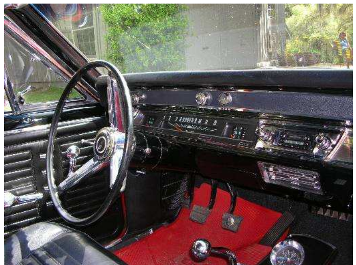
The 1967 Chevrolet Chevelle SS - Interior