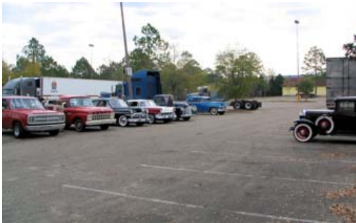
Members gathering to go on the road (semi's not part of tour!)

The weather was beautiful and dry, 69 degrees with flowers and trees just starting to bud and wild life along the roadside.