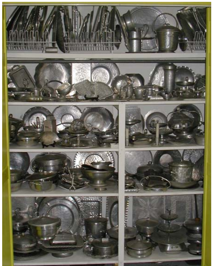
A closet full of antique hammered aluminum.