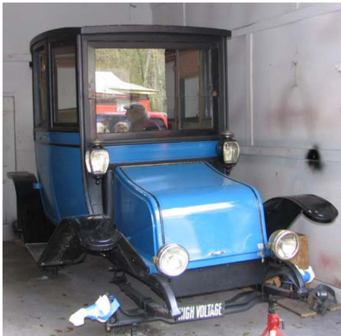
A restored and drivable 1912 Detroit Electric undergoing maintenance..