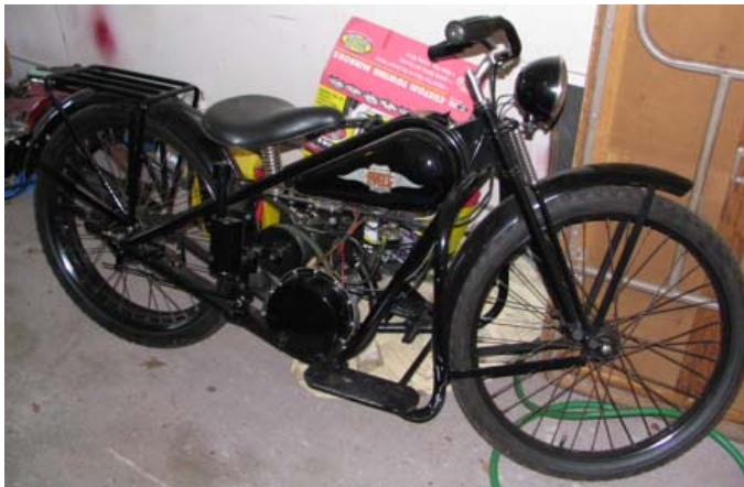
A nicely restored 40's era Simplex Servi Cycle.