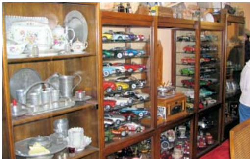
One of many display cases in the Gordon home.

yard and started opening garage doors and car trailer doors and explaining a little about each treasure. All questions were answered as we looked upon model Ts to a 56 T-Bird, 1912 Detroit Electric to a Reo, with no limit to Steve's collecting hobby. A museum of about 30 automobiles from street rod, modified and originals of all makes and models.