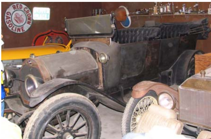
An Overland touring car.