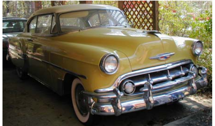
1953 Chevrolet Bel Air Sport Coupe